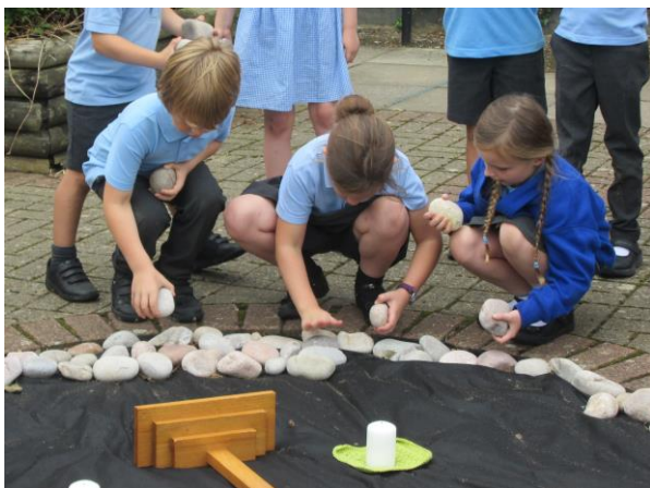
Our Quiet Reflection