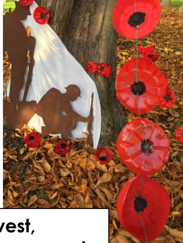
Harvest, Remembrance and Children in Need