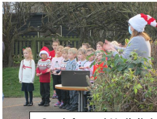
Our informal Nativity!