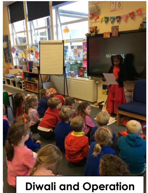
Diwali and Operation Christmas Child