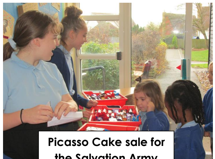
Picasso Cake sale for the Salvation Army