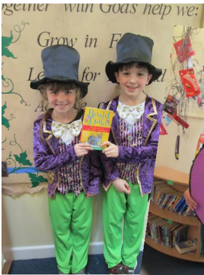
World Book day 2019