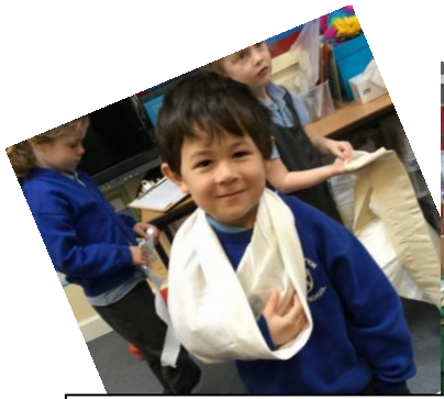
Paramedic visit to Van Gogh Class