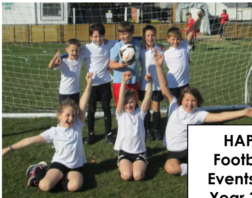
HAPP Football Events for Year 3 - 6