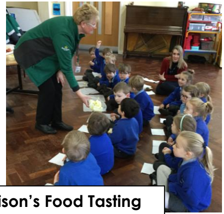
Morrison's Food Tasting