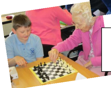
Lent Challenge Invite to Rose Cottage for lunch