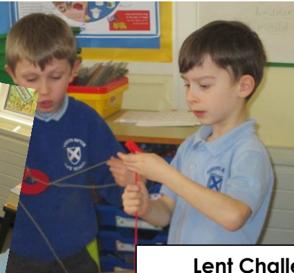
Lent Challenge Learning new skills