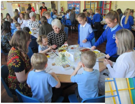
Mother's Day Lunch Thank you for coming.