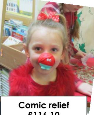
Comic relief £116.10