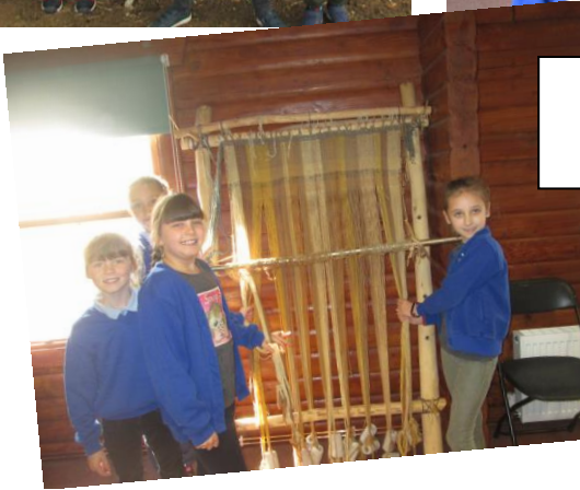
Kandinsky Class went to Flag Fen