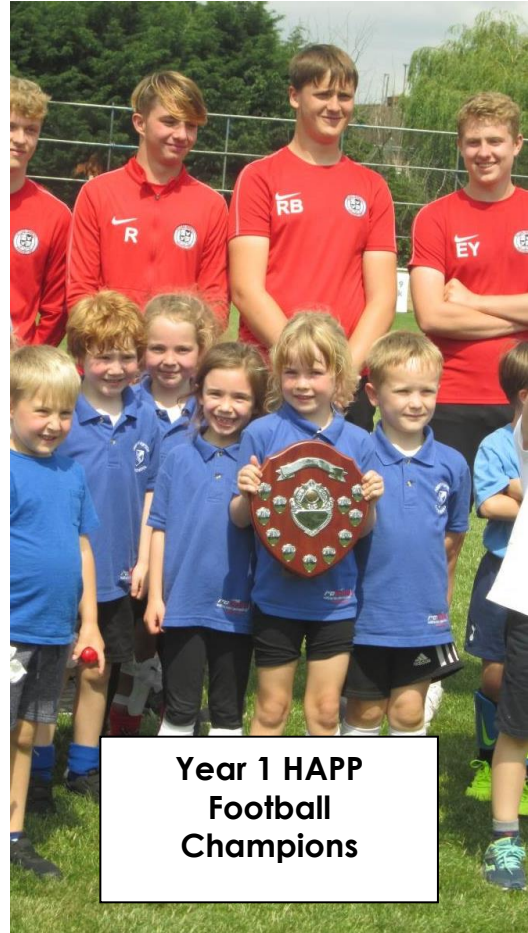
Year 1 HAPF Football Champions