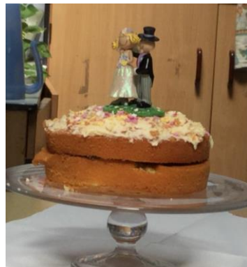
Van Gogh Wedding