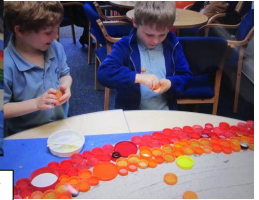
Our recycled bottle top rainbow