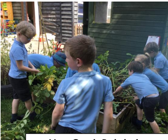
Van Gogh Potato harvest!