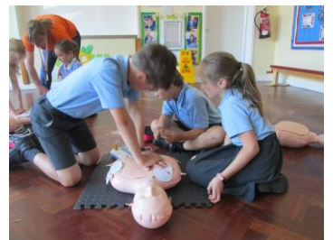
Magpas visit – CPR training