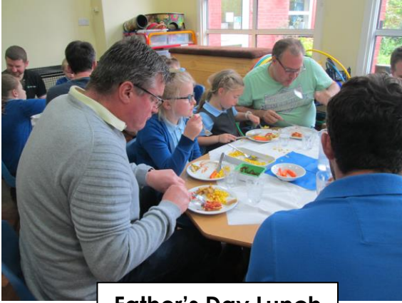
Father's Day Lunch