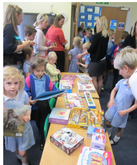
The Book fair sold £827! Thank you!