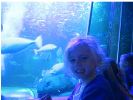
Whole School trip to Hunstanton