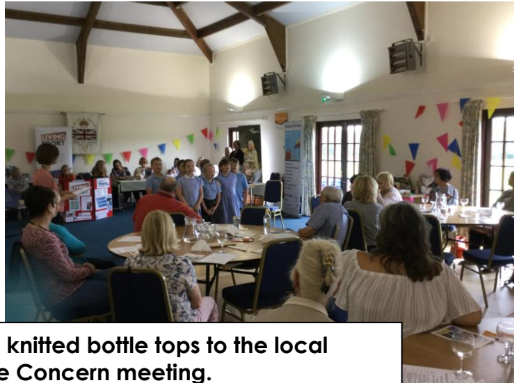
Presenting the knitted bottle tops to the local Age Concern meeting. Thank you for the 212 donated knitted hats!!