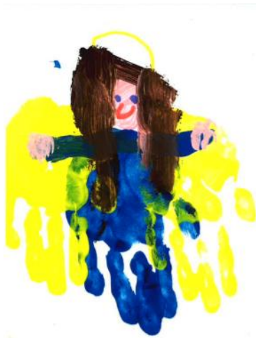
Van Gogh Class

Each child has designed a Christmas card and a copy of their design, along with an order form has been sent home today. Their design can be ordered on Christmas card, mugs, tea towel and more! They make great presents for all the family. Each class has chosen a different design.