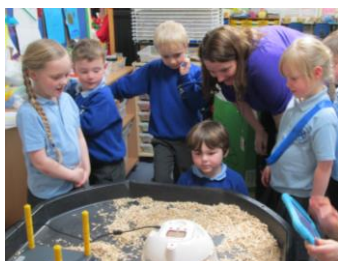
Chicks in Van Gogh