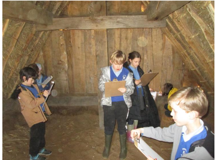
Year 3/4 West Stow Trip