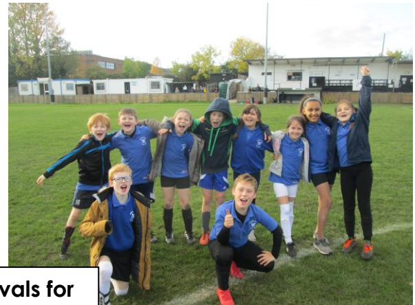
Football festivals for Year 6 and 5.