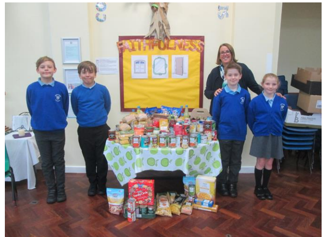
Our Harvest Festival donations were taken to Coneygear Court in Huntingdon.