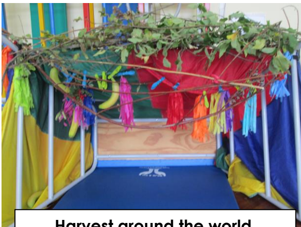
Harvest around the world. We learnt all about the Jewish festival of Sukkot and created our own Sukkah.