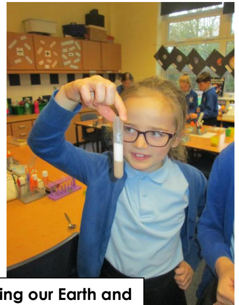
Science in Kandinsky this term! Lots of fun exploring our Earth and Space topic, alongside investigating the three states of matter!