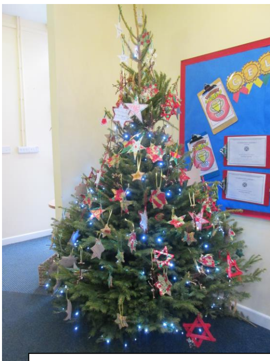
Christmas Decorating morning.