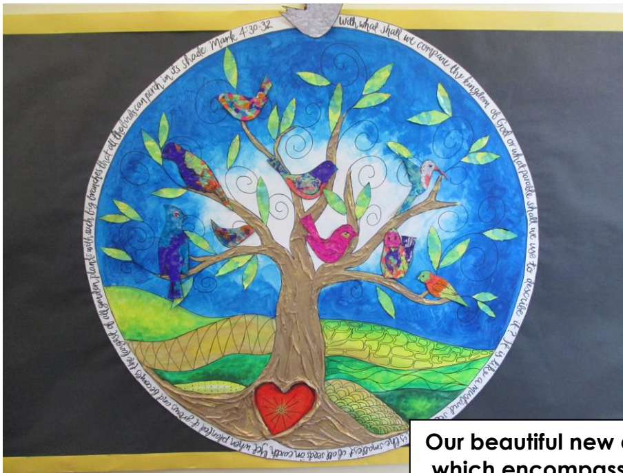
Our beautiful new display which encompasses our school vision.

With what should we compare the kingdom of God or what parable shall we use to describe it? It is like a mustard seed which is the smallest of all seeds on earth. Yet when planted it grows and becomes the largest of all garden plants with such big branches that all the birds can perch in its shade. Mark 4 : 30-32