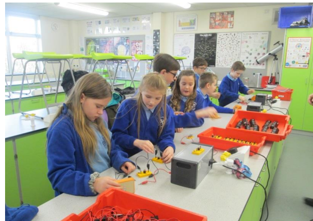
Building links with St Peters Secondary science department, Picasso Class investigated electricity with the wealth of circuit equipment available.