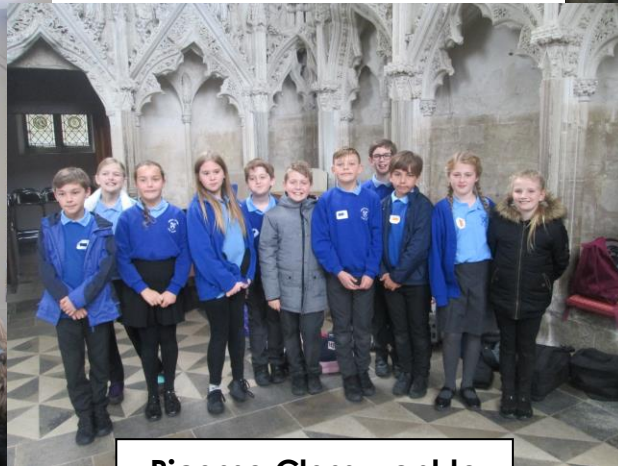
Picasso Class went to the Ely Reflection Day