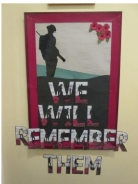
The Whole School learnt about Remembrance Day and why we remember.