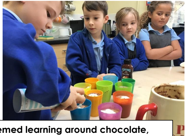
Monet class have loved their themed learning around chocolate, making hot chocolate and reading Charlie and the Chocolate factory.