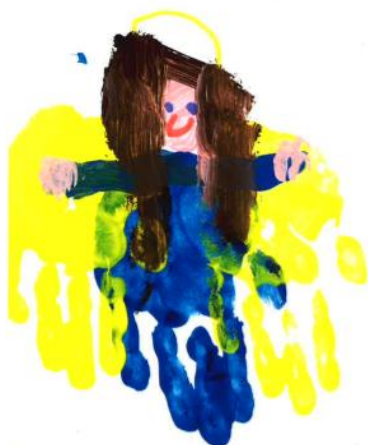
Van Gogh Class

A quick reminder that ALL orders for Christmas cards must arrive in the school office no later than Monday 9 th November so that we can ensure swift delivery to you well in advance of Christmas. This is a great fundraiser for our school so all orders are gratefully received.