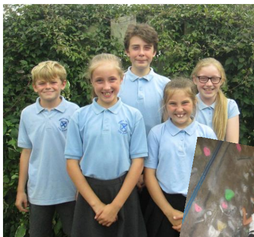
Our Year 6 Leavers