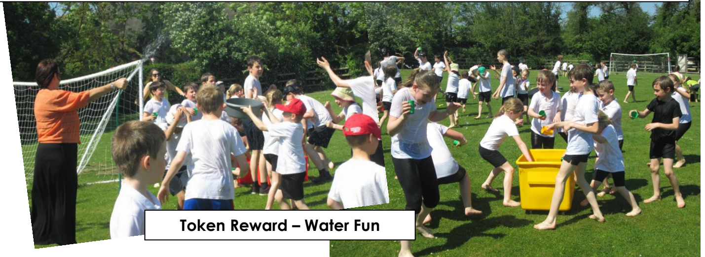
Token Reward – Water Fun