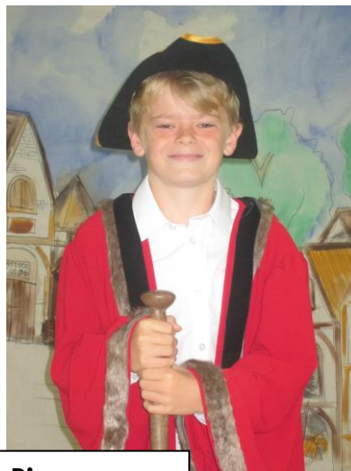
KS2 play – The Piper