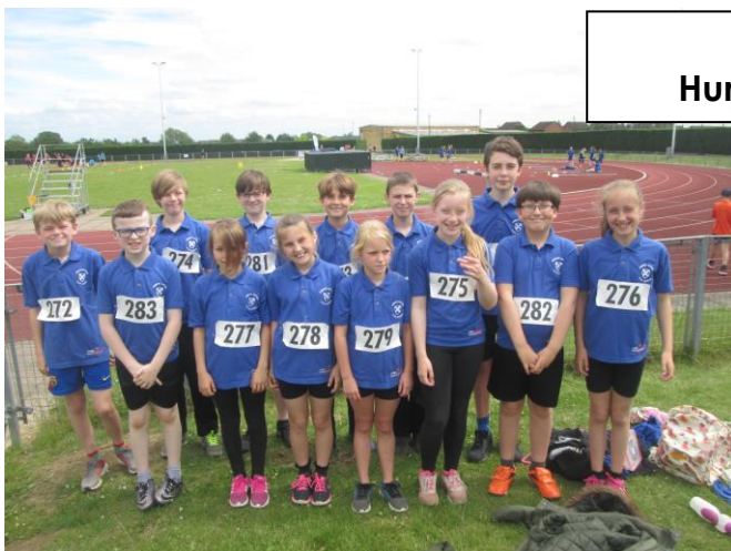
Picasso Class took part in a Hunts Sports Quad Kids Competition